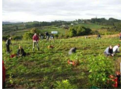
Tree planting on the Mangemangeroa Reserve