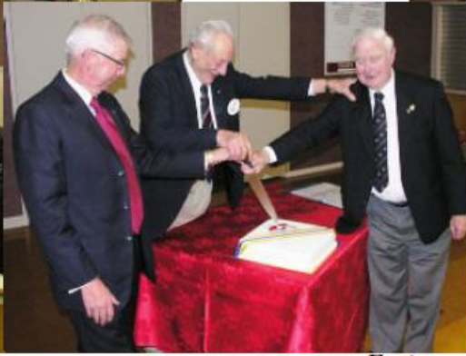
47th Anniversary of Club Charter