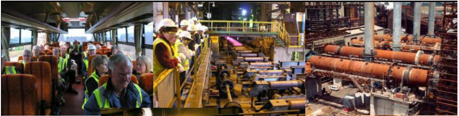
Vocational visit to Glenbrook Steel Mill