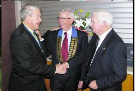
Paul Harris Fellowships