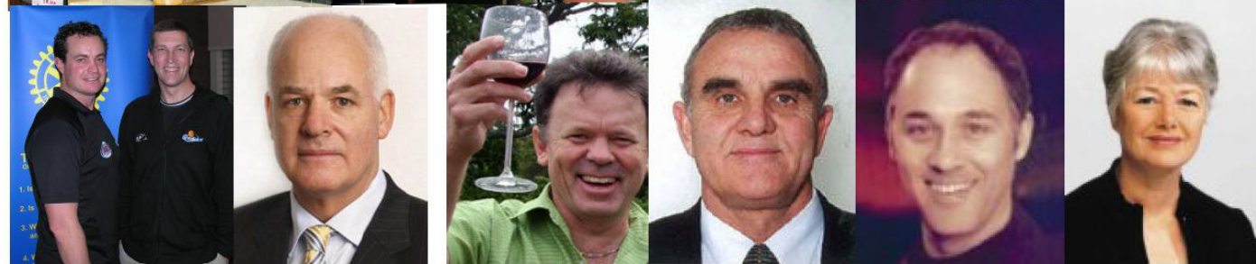
Jeanette Fitzsimons MP