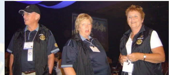
Part of the Kiwi contingent who made the journey to the RI Convention in Salt Lake City.

The Bucklands Beach Intermediate School Tree-Planting at Mangemangeroa planned for last week has been rescheduled for Thursday 28th June, meeting at the Barn on Somerville Road at 08:45 and should take only a couple of hours. Any Rotarians who are available to assist are invited to attend.